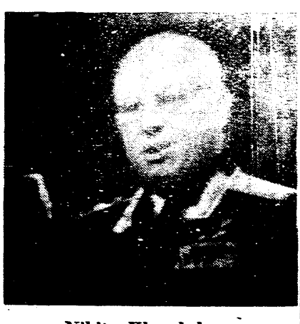
Nikita Khrushchev In Power Struggle

While Khrushchev was eliminating his political rivals, Mr. Kiraly continued, the young people of Hungary took more and more intellectual freedom for themselves. The uprising, which started as an evolution of liberalism rather than of the Revolution.