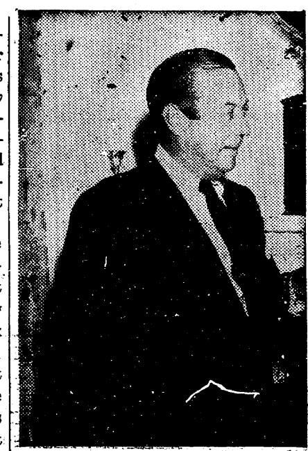
Mayor Robert F. Wagner Speaks in Albany

SG leaders here, who have been if the student campaign spread leading the CU's free tuition fight, upstate, "free-tuition would be in felt that any mass rally in Albany, no matter how well attended by